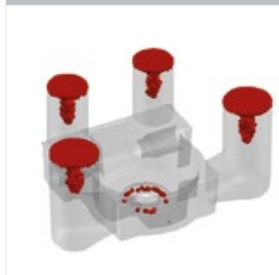
Fig. 1: The defects as seen in the initial castings before the change was made