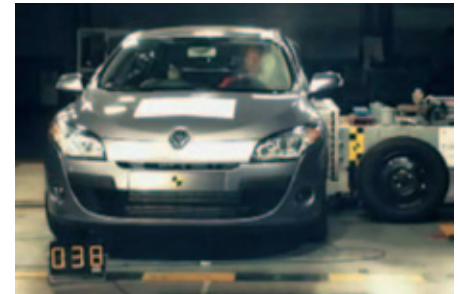
Mégane III lateral crash simulation and EuroNCAP test

“PAM-CRASH is a tailored solution fully adapted to Renault’s problematic especially during the development of the Mégane III.”